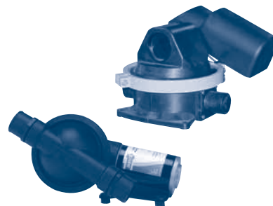
50890 / 59090