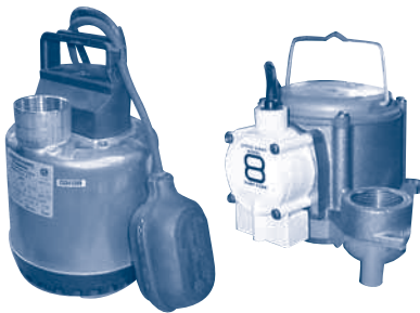
Bronze and Stainless