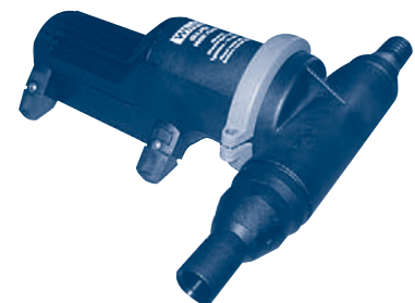
Gulper High Flow