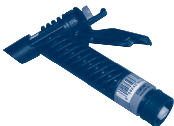
Swivel, Quick Release, Check Valve