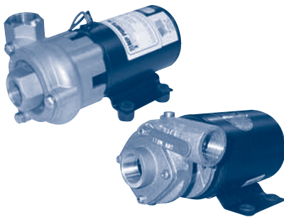
316SS and Bronze