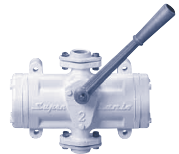
Bronze Hand Pump