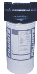
Particulate or Water Removal