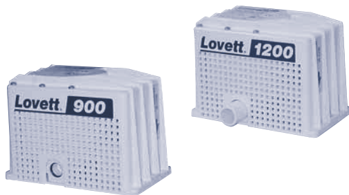
Heavy Duty "Repairable" Series