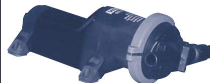
Gulper 220 Series