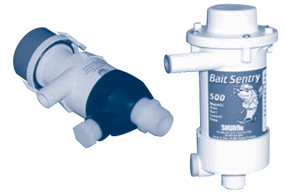
Dual Port Livewell Pumps