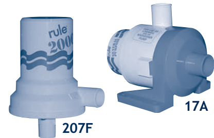
High Capacity Pumps