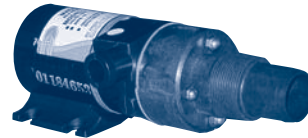
18590 / 18690