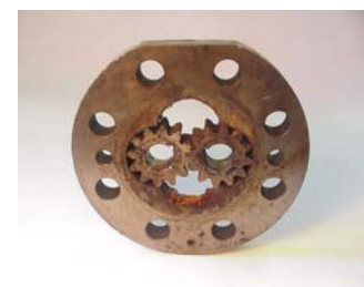
Gears fused to corroded case