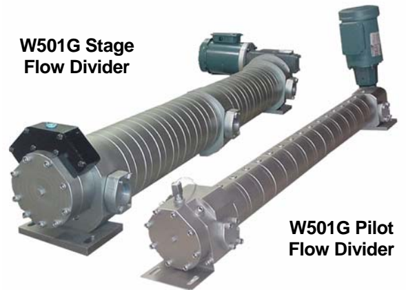
W501G Pilot Flow Divider