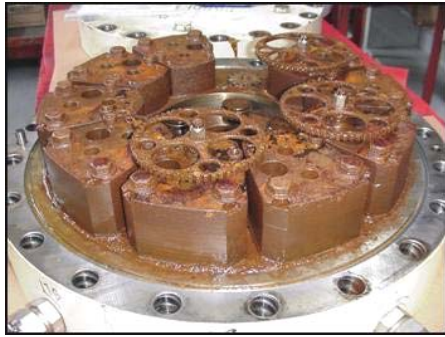
20333 Type 1 Frame 9FA Flow Divider