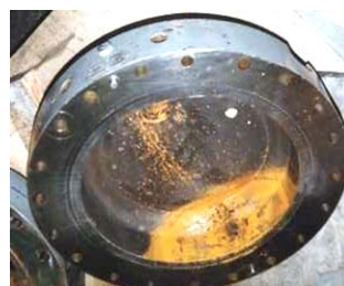
Corrosion caused by water in fuel from leaky check valves