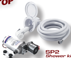
SP2 Shower kit Part Number 164 900 15