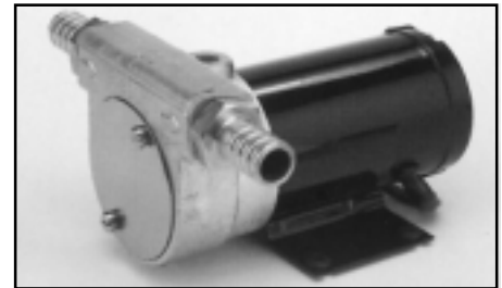
Model 50130-1000 12 Vdc Model 50130-1100 24 Vdc

Basic Pump with By-Pass for use with Trigger Nozzle