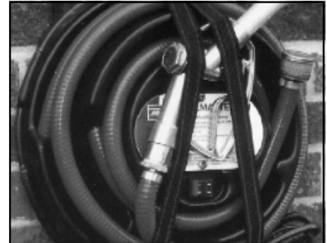
Model 50140-0000 12 Vdc Model 50140-0100 24 Vdc

⚠ WARNING Not for pumping gasoline or flammable liquids.