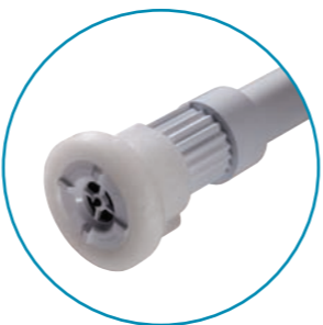
Float Switch For automatic shut-off