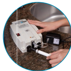
Easy to Install New quick connect port/fittings