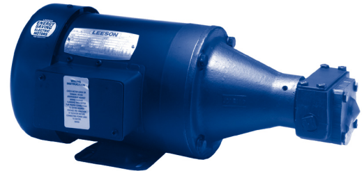
5U pump with motor