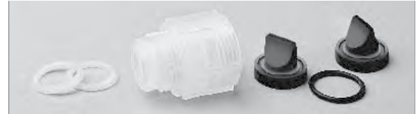
1" and 1½" Bellows Kit

(Valve extension required only on suction port.)