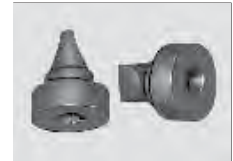
½" and ¾" Bellows Kit

Duckbill valves are required in those applications where heavy slurries or fibrous materials are being pumped. Heavy slurries should be flushed from the bellows before the pump is shut down. The standard elastomers are EPT/EPDM and Viton®/Fluoroelastomer. However, Butyl, Hydrin, Kel-F®, Silicone and Nitrile can be supplied.