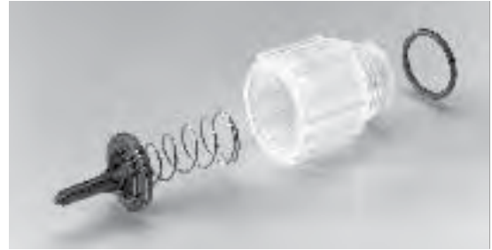
(Valve extends on required on y on suction port.)

Anti-siphon springs are available to springload poppet valves. Use of these springs produces more positive shutoff of poppet valves and permits use of the pump where there is a positive pressure on the suction side. Available for the 1", 1½", and 2" models. To order, select the proper spring material and O-ring by referring to the Chemical Resistance Section. The appropriate kit can then be chosen based on the blow-off pressure (PSI) required.