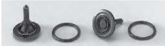
1" and 1½" Poppet Kit