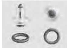
½" and ¾" Poppet Kit

The standard elastomers for the poppet valves and O-rings are EPT/EPDM, and Viton®/Fluoroelastomer. These elastomers have historically been able to handle the vast majority of the applications in which we've been involved. However, Butyl, Hydrin, Kel-F®, Silicone and Nitrile can be supplied for chemicals requiring such materials.