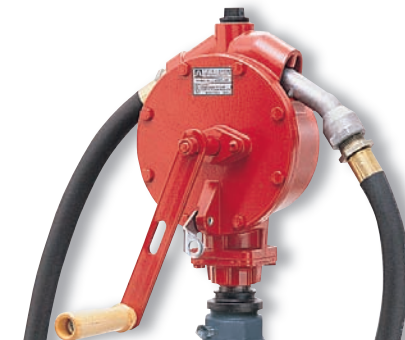
Model FR112 Rotary Hand Pump Series 100