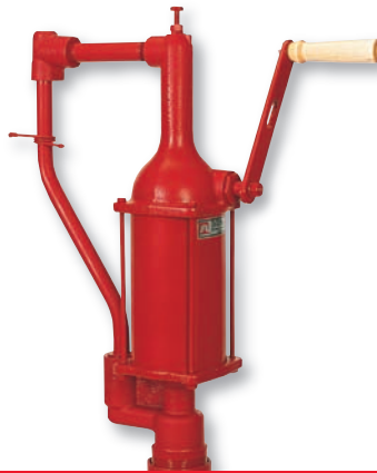
Model FR31 Quart and Liter Stroke Pump Series 30