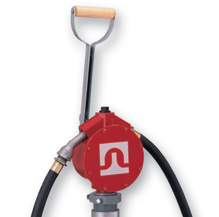
Model FR152 Piston Hand Pump Series 5200