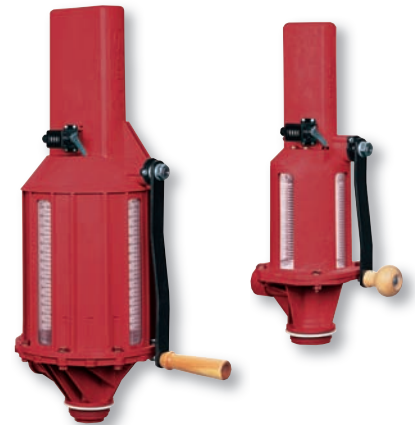
Model FR37 & FR38 Gallon or Quart Volumetric Hand Pump Series 30