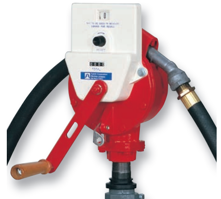
Model FR112C Rotary Hand Pump with Counter Series 100