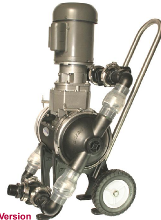
Model 25060 Fixed Speed Version Shown With A 110/230V Single Phase TEFC Motor and Optional Wheels and Handle