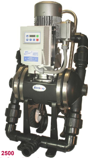
Model 2500 Variable Speed Version Shown With Optional Wheels and Handle

Flexibility in a simple to understand and maintain package, the 2500s can do just about any pumping task you need done at suction lifts up to 25 ft, discharge heads up to 25 ft and volumes up to 25 gpm.