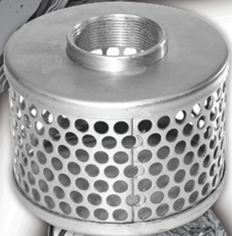
Standard Suction Strainer with Small Openings