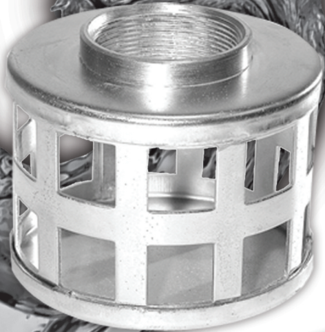
Trash Type Suction Strainer with Large Openings