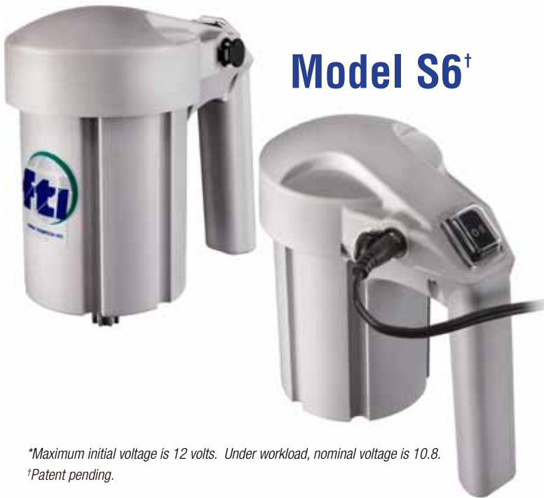
Model S6 †